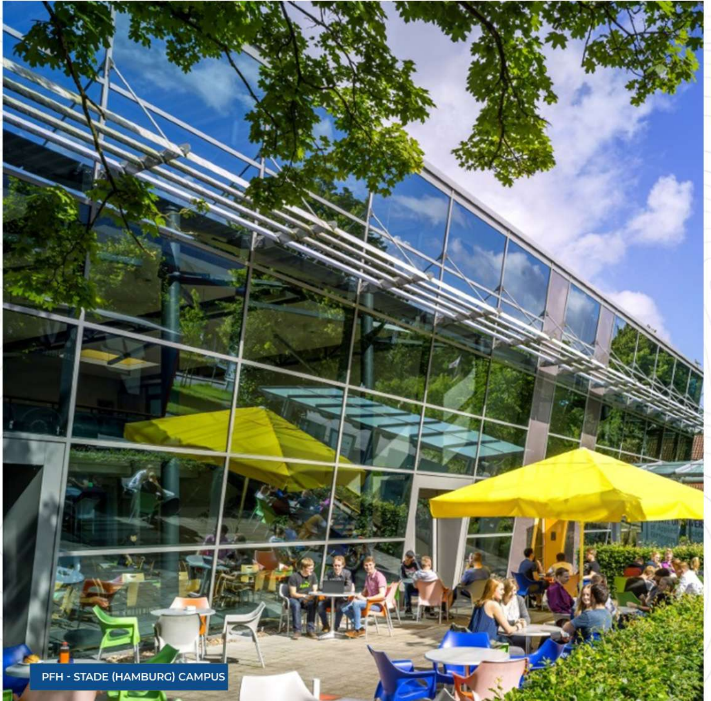
PFH - STADE (HAMBURG) CAMPUS